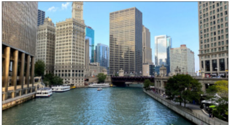
Chicago River. (facing Michigan Ave.)