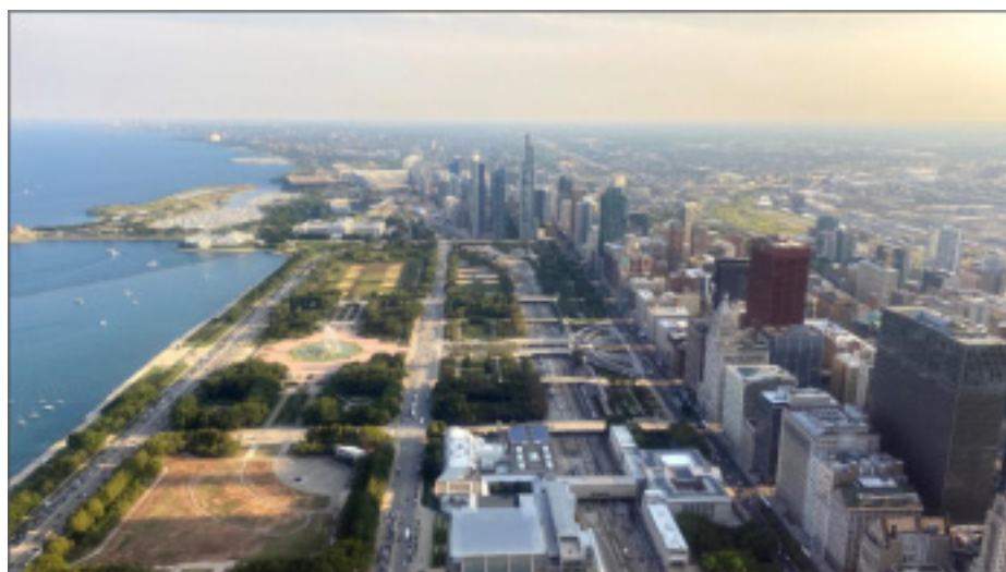
Chicago (and a glimpse of Indiana in the Horizon).

TEAM Consulting enjoys providing support to the IAAO conference each year. This year, TEAM Consulting sponsored the U-40 and Professional Designee receptions, where we were able to celebrate recent designees and