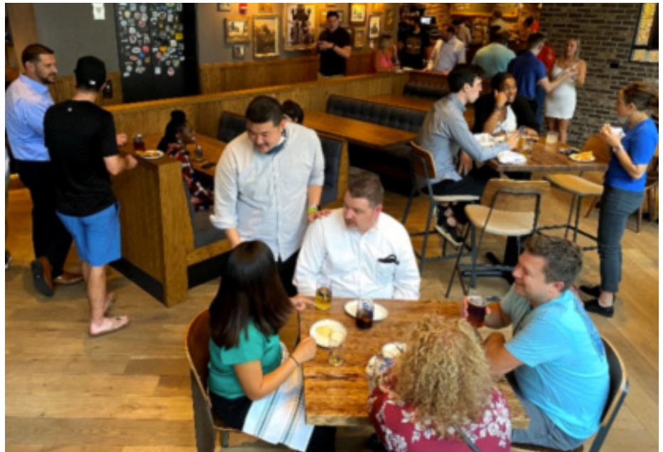
U-40 Reception at Giants Brewery.

I think we can do better with the diversity of instructors and leaders that we have in the assessment field. Some of us might have to step out of our comfort zone and take a chance on someone who doesn't look like us. Maybe it's recruiting talent through different human resource channels than we normally rely on. Have a conversation with someone you usually avoid—maybe they need a mentor. Embrace change. ♦