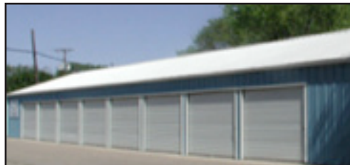
Valuation of Self-Storage Properties

And so many more! Check out all of our workshops at www.teamconsulting.cc