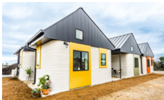
ICON delivered 3D printed homes to house homeless.

■ Builderonline.com , May 4, 2020. “Buyer demand and healthy housing-market dynamics will prevent U.S. home prices from dropping more than 2%-3% —or more than 1.7% year over year—in the wake of the coronavirus, according to a forecast released today by Zillow. The forecast says home sales will fall as much as 60% this spring and take through the end of next year to recover, while prices will fall through the year but recover a few months sooner.” https://bit.ly/2LaPVhE ♦