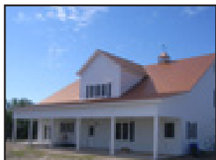
Valuation of Barndominiums