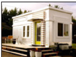
Unique & Challenging Homes