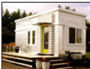
Unique & Challenging Homes